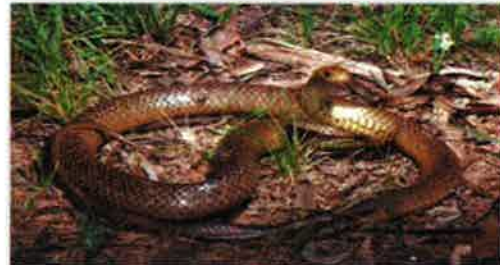
Common Brown Snake, Demansia textilis

The unseasonal weather in Sydney has made snakes active earlier in the year than would generally be the case and workers are reminded to be vigilant and report all snake sightings to the site based Environmental and Safety representatives.