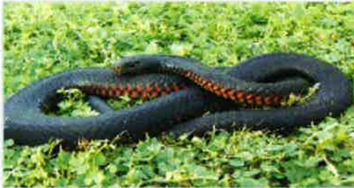
Red-Bellied Black Snake, Rseudechis porohyriscus