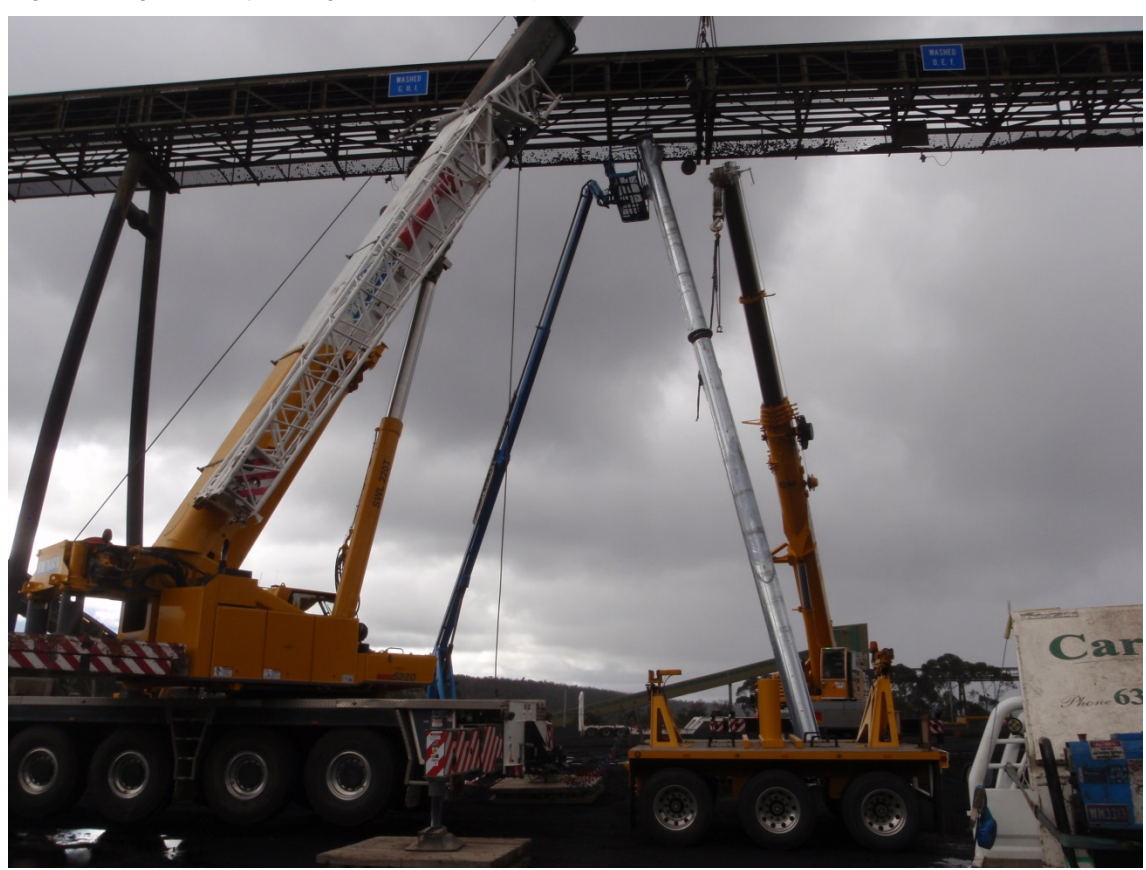
Figure 1: Leg assembly resting on elevated work platform

Safety Alert No: SA17-04 File number: PUB17/208 SinNot: 2017/00593 Phone: 1300 814 609 Date published: 10 May 2017